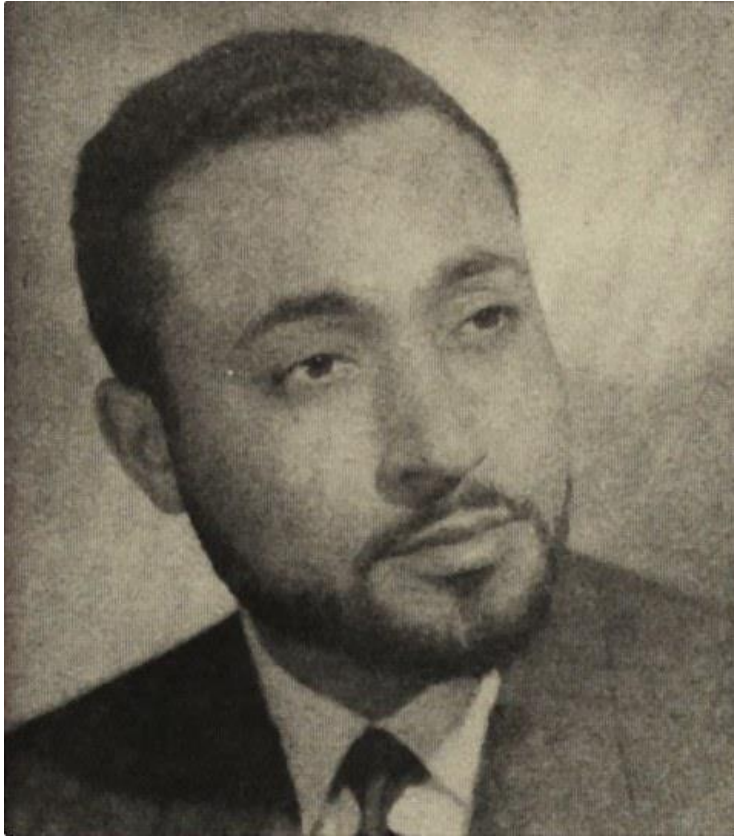
Said Ramadan, Muslim Brotherhood agent